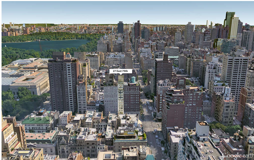
Google Earth aerial showing location of 27 East 79th Street