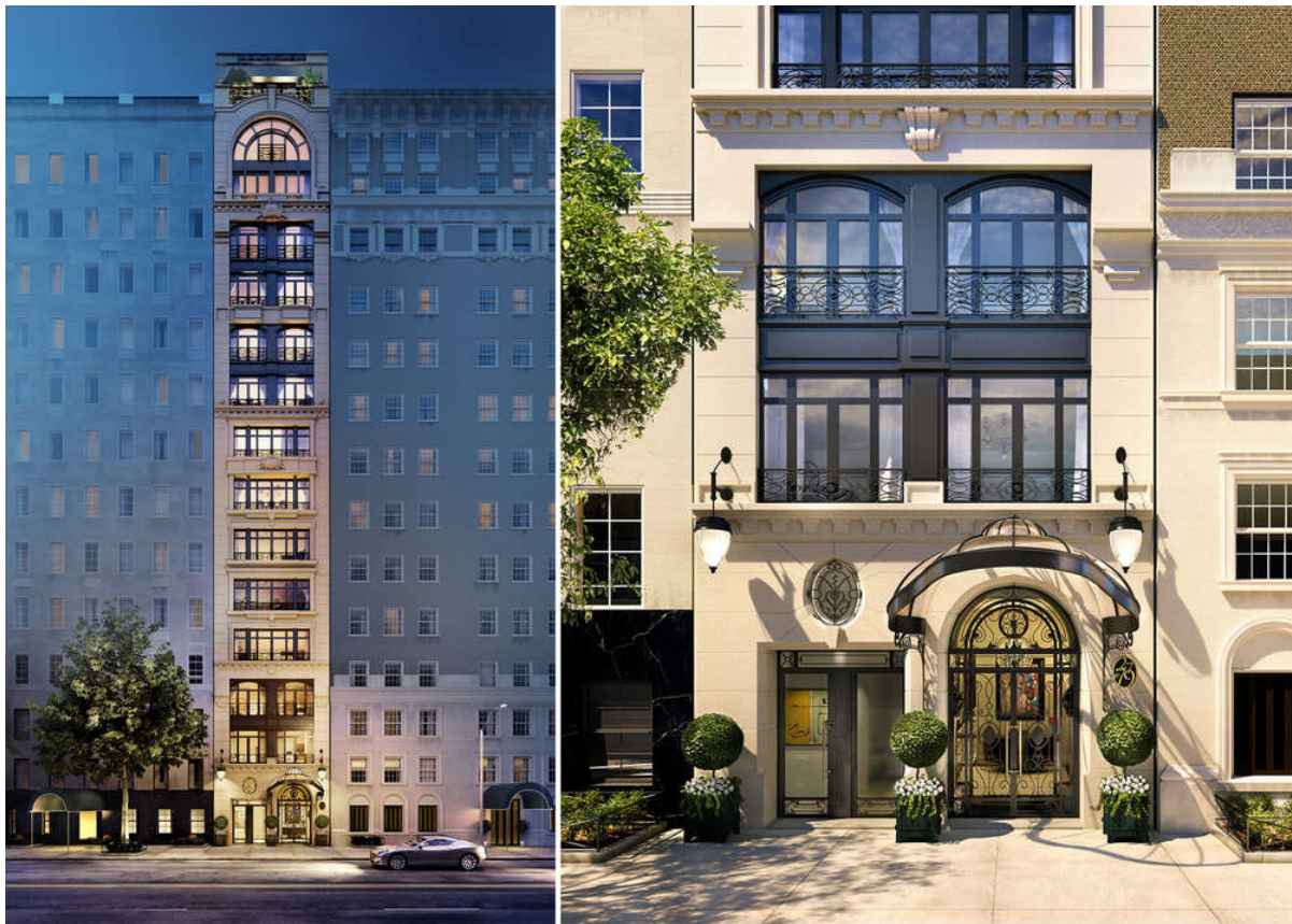
27 East 79th Street (Renderings courtesy of Adellco)

B eaux-Arts architecture is alive and well on the Upper East Side. On East 79th Street, between Fifth and Madison Avenues, is one of the most architecturally stunning crosstown blocks in Manhattan. Coined as "the Cook Block," the south