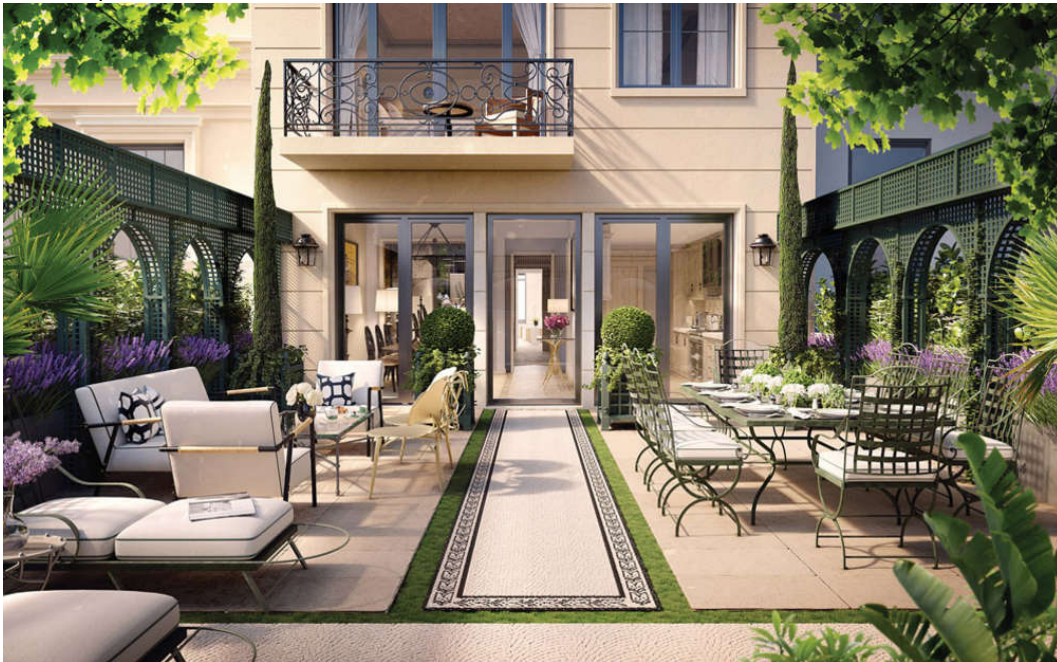
Private patio of townhouse unit

spreads with white oak parquet de Versailles floors, custom moldings, and custom-designed fireplaces.