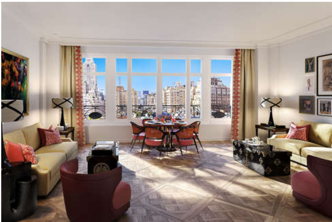
Simplex living room

Sales at 27 East 79th Street are forthcoming and the homes will be priced from $5.3 million. New construction along the Upper East Side's timeless blocks between Fifth and