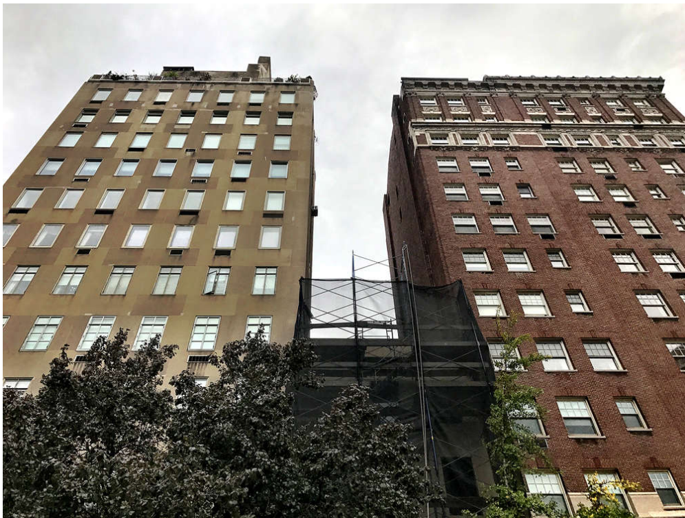
Demolition proceeding of townhouse at the site

https://www.cityrealty.com/nyc/market-insight/features/future-nyc/off-millionaires039-row-lauded-parisian-firm-designs-vintage-condo-27-east-79th-street/14046